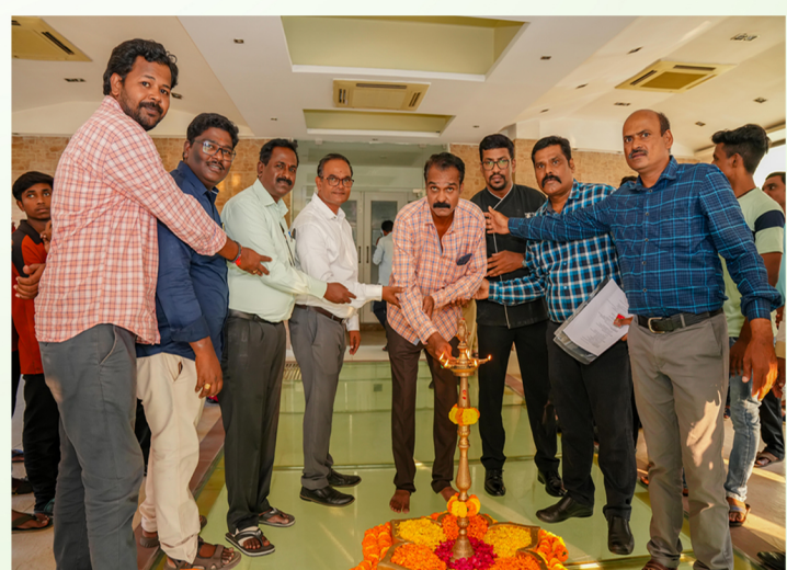
Barbeque Food Festival & Karaoke Night